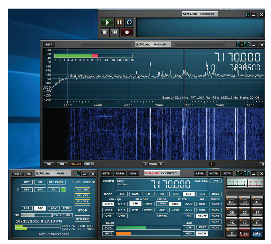
Figure 7 — RSP1 receiving on 40-meter SSB using SDRuno software. Only one receiver is shown here, but the application can open several simultaneously.

You can even use the SDRplay as a server, allowing others to access it remotely via the Internet. The software applications I used offered server